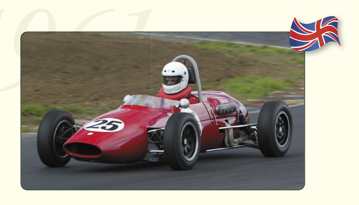
1961 Gemini Mk3A

1961 ex Rex Flowers, Chassis no. 09. Built by Chequered Flag Engineering in UK.