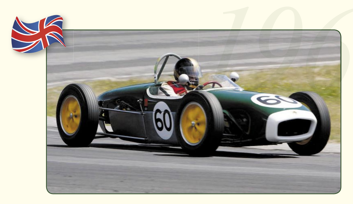
1960 Lotus 18

1960 Lotus 18 Formula Junior, Ford engine, chassis 18J/744. Current competitor in New Zealand.