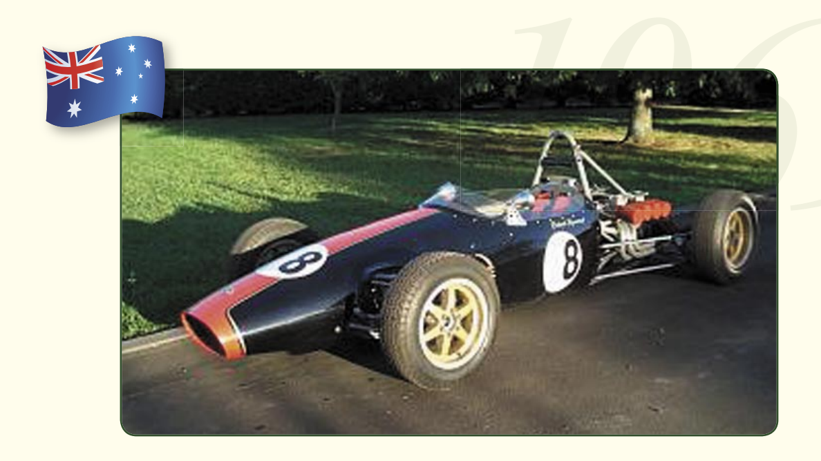
1963 Elfin Catalina

1962 Australian built Lynx FJ originally for Peter Williamson with Ford 105e 1000cc engine. Chassis 15. Subsequently 1340cc supercharged engine but presently being restored back to FJ specifications.