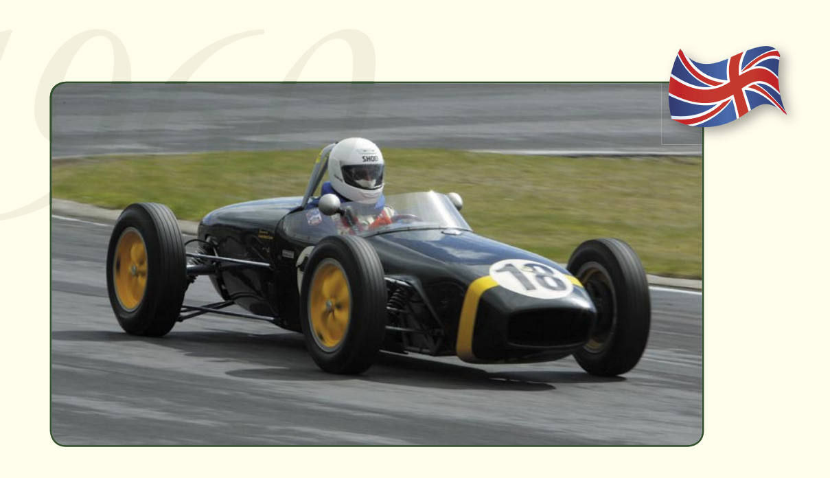
1960 Lotus 18

1960 Lotus 18 Formula Junior, Ford engine, chassis 18J/744. Current competitor in New Zealand.