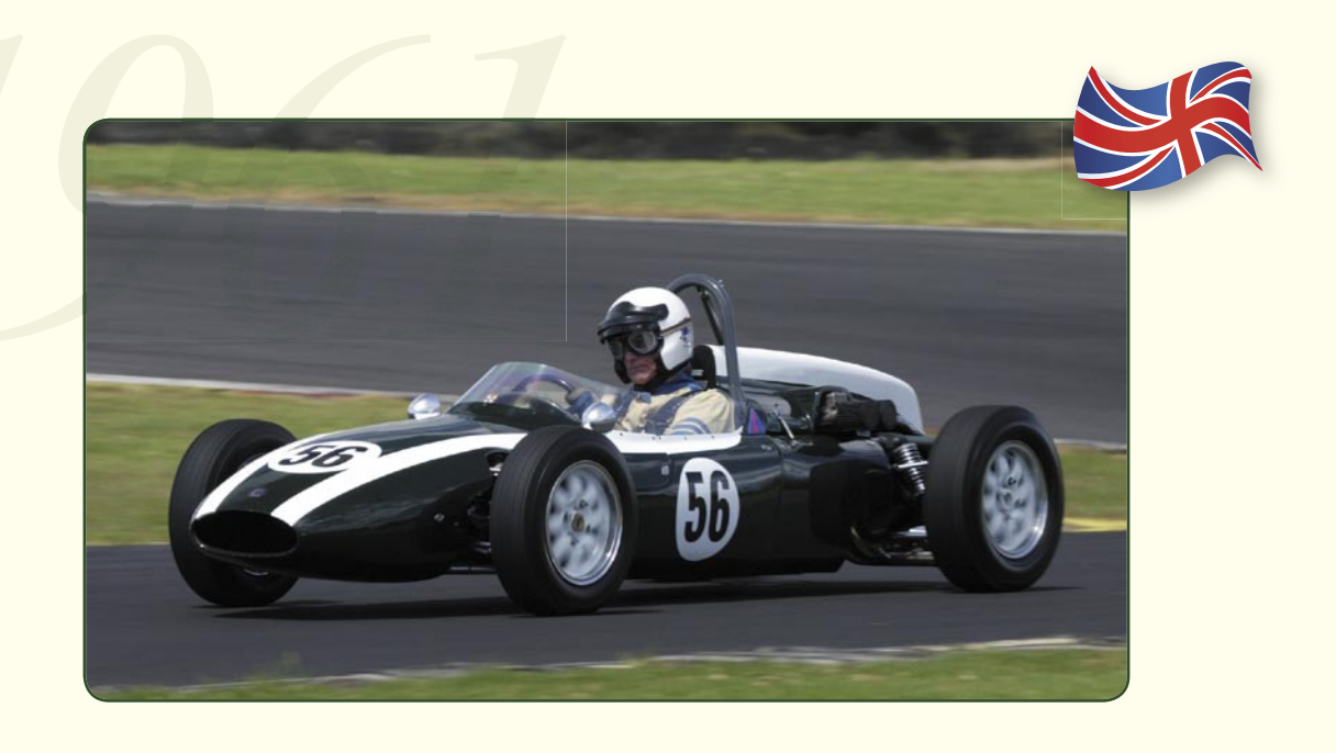
1961 Cooper T56

1961 FJ BMC 1000 imported to NZ after spending most of it's life in Ireland.