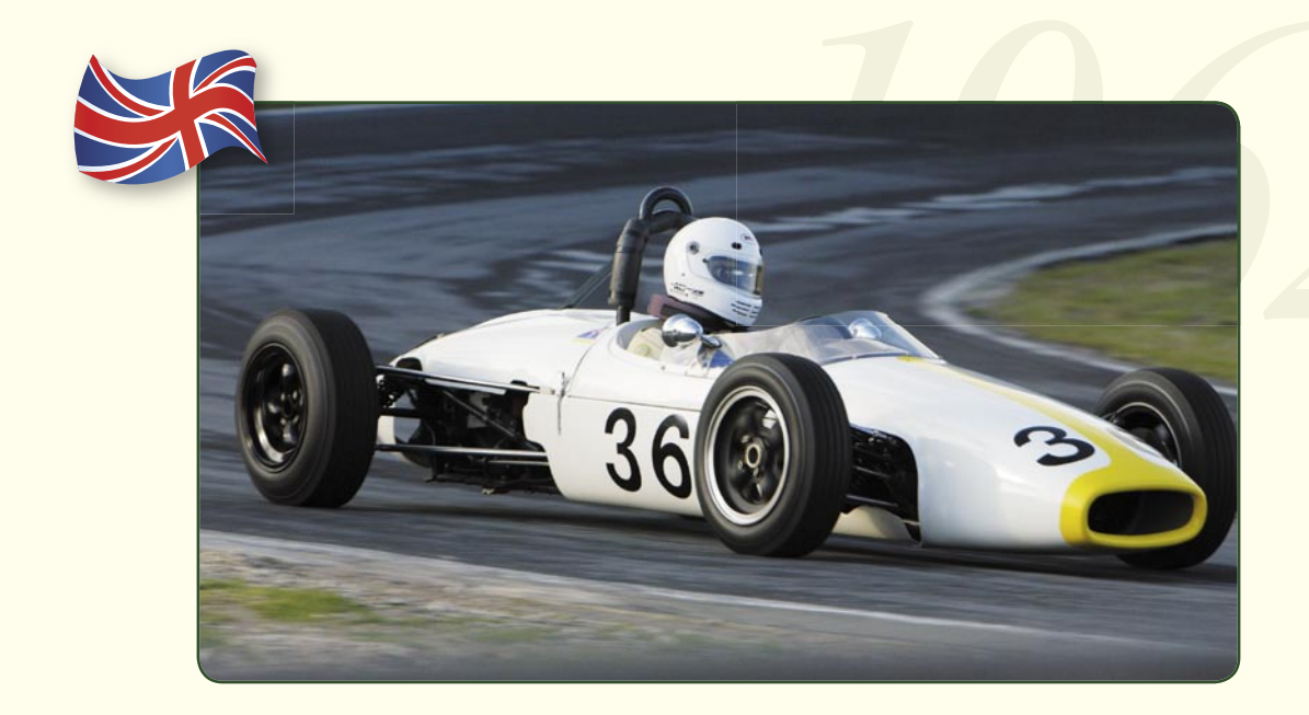
1962 Brabbam BT2

1964 FJ/F3 car. Built with FJ motor and raced in Macao 1965 as a FJ and later in Malaysia.