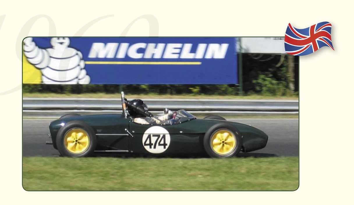
1960 Lotus 18

1960\ Raced predominately in the USA until coming to NZ in 2006.