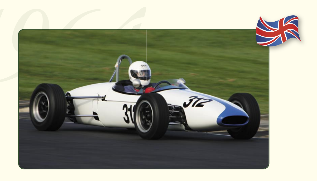
1964 Brabham BT9

1964 FJ/F3 car. Built with FJ motor and raced in Macao 1965 as a FJ and later in Malaysia.