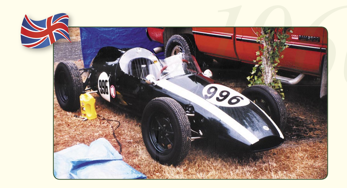
1960 Cooper T52

1961 ex Rex Flowers, Chassis no. 09. Built by Chequered Flag Engineering in UK.