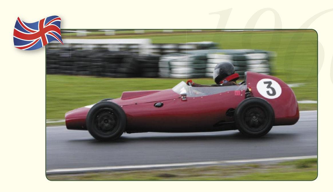
1960 Emeryson Elfin Mk1

FMZ NZ. The only front engined Formula Junior built in NZ. BMC 1100 with alloy body.