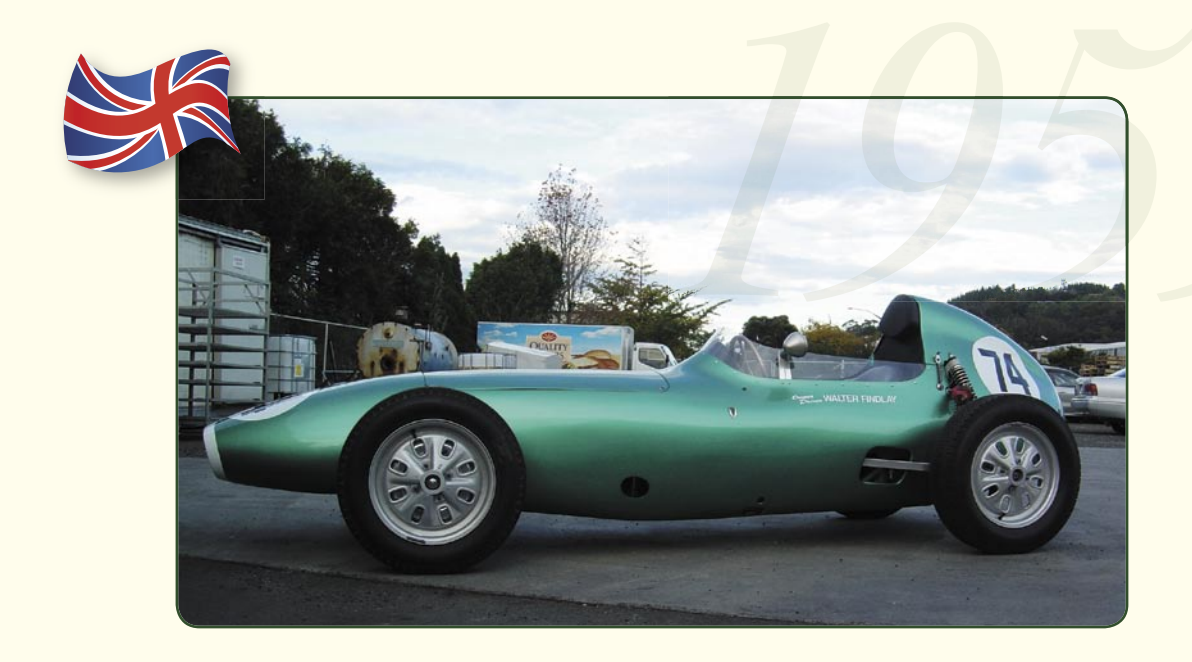
1959 Elva DKW

1961 FJ BMC 1000 imported to NZ after spending most of it's life in Ireland.